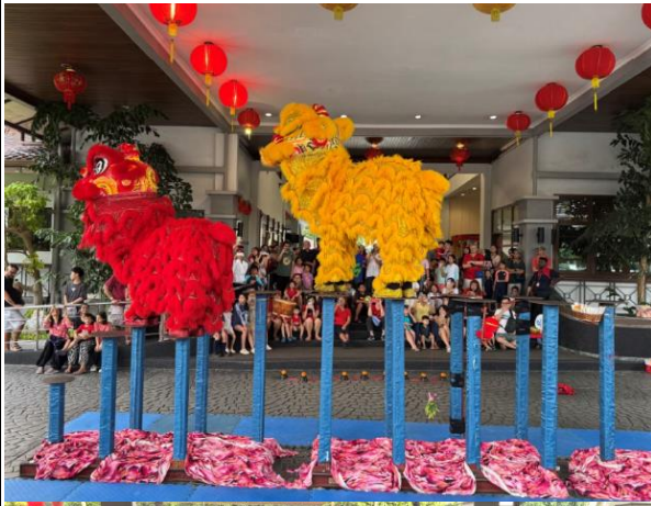
Lion Dance and Drum performance