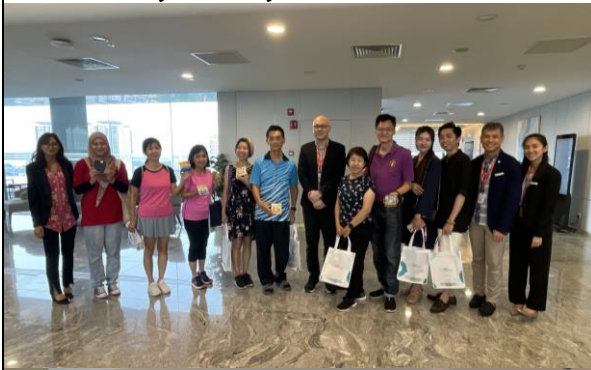
Visit to Sunway Sanctuary