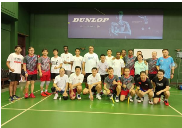
Interclub Friendly Games 2024: Badminton, squash, table tennis, tennis, and snooker