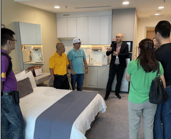
Tanglung Walk 2024