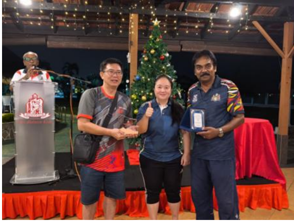
Inter-Club friendly game with Sungai Ujong Club (Away)